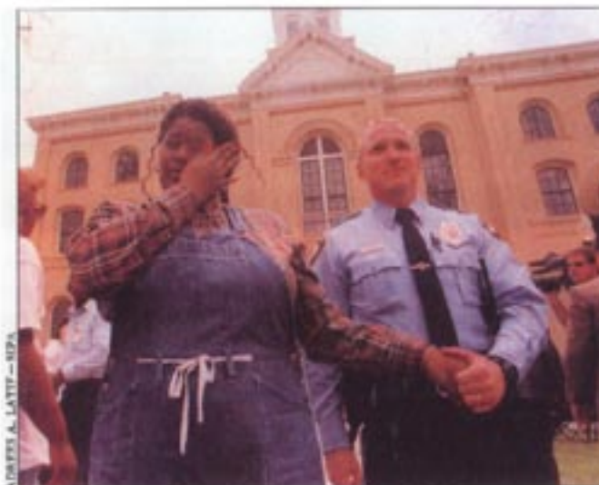
A certain comfort: Coming together in Jasper