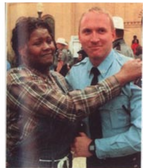
Verdict: Relief in Jasper was visible after the sentencing ( see NATION )

many ways established, codified, and negotiated in a legal and legislative context, its meanings, and the discourses through which those meanings are maintained, are also constructed in and through the media accounts and reconstructions of specific incidents of violence.